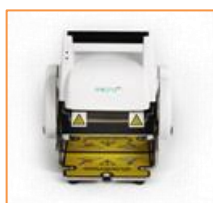
Micro TS Microplate Heat Sealer V903001