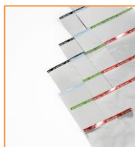
Film and Foil Microplate Seals