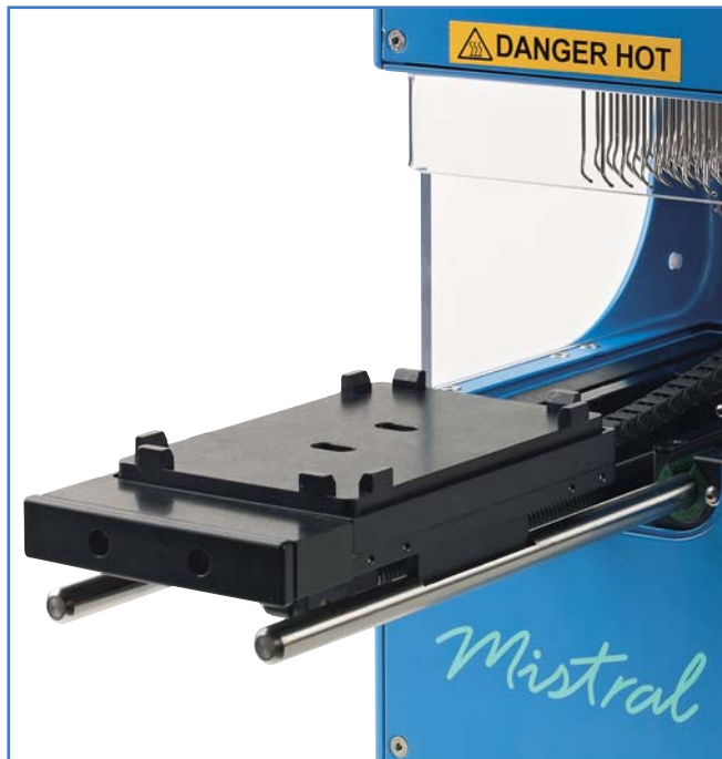
▲ An industry standard plate nest accepts all standard SLAS/ANSI footprint plates with heights up to 60mm and features positive plate detection. The extendable rails can reach up to 240mm in front of the Mistral for ease of integration with other equipment.

The evaporation table is able to rise under the control of a stepper motor as the drying process proceeds. This can be programmed at a suitable rate for each solvent type being evaporated. In addition, gas temperature, pressure and flow rate can all be programmed individually and stored in up to thirty multi-step programmes on the Ultravap Mistral controller. Each programme allows the table to rise in up to five distinct ramped phases, so that a fast initial drying period can be followed by a gentler final drying phase. The new Ultravap Mistral is usually located on the right-hand side of the robot deck. Control commands are sent directly from the robot controller to the Mistral. These standard commands are listed in the manual, but most robot manufacturers have drivers available to control the Mistral, making integration a seamless process.