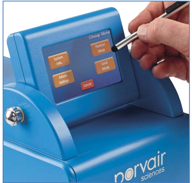
▲ All parameters can be programmed through the large colour touch screen display, using the stylus provided.